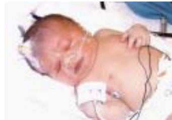
Duncan Joseph Grant