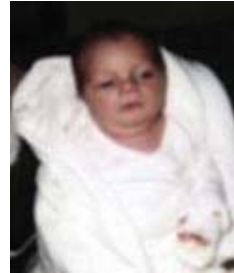
Christopher M. Masterson